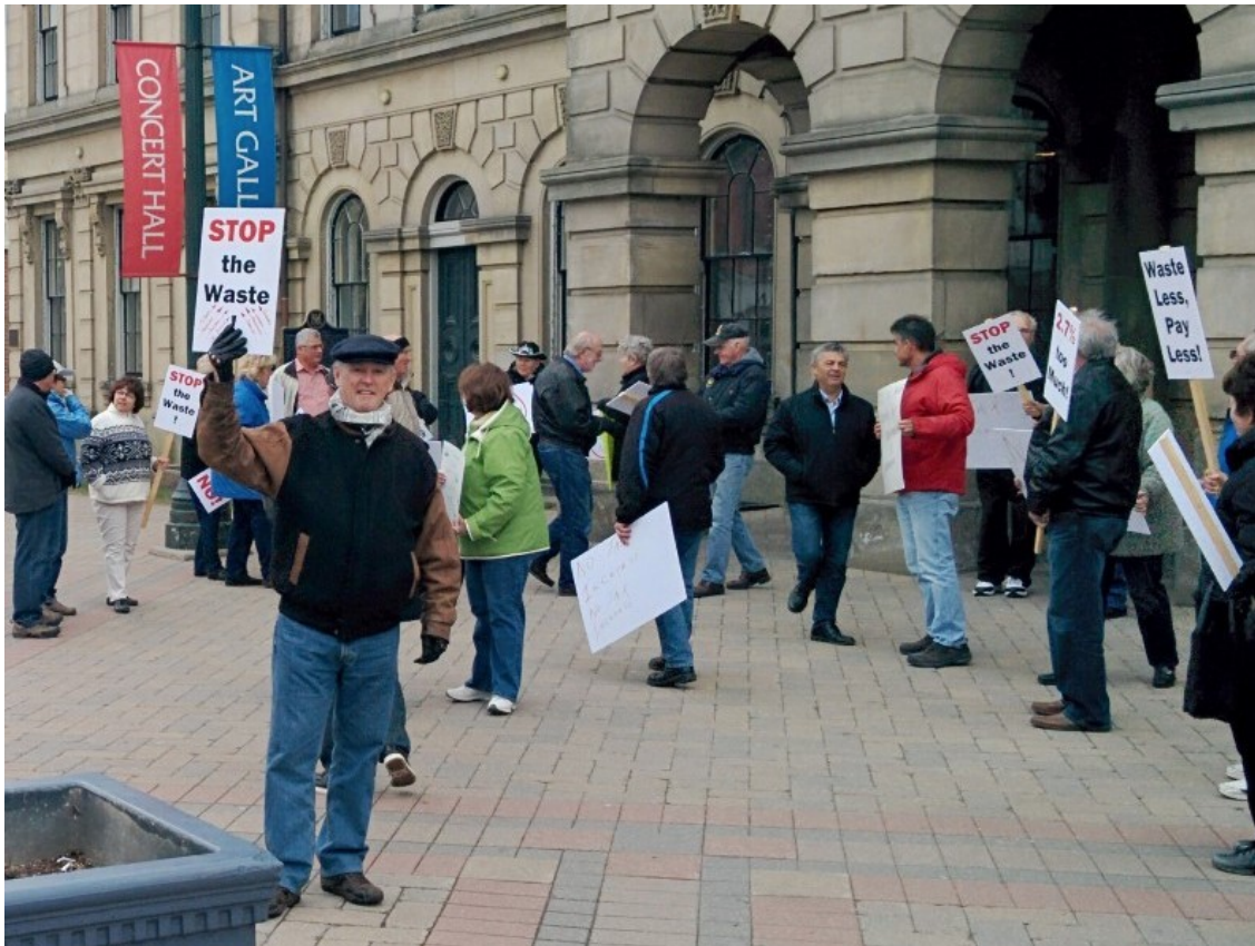
Supporters of the Cobourg Taxpayers Association held a rally outside of Cobourg Town Hall prior to the final vote on the 2016 budget.

Many of these questions were asked during the budget meeting.